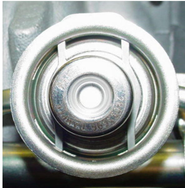
Photo 3 Damper held by retaining clip