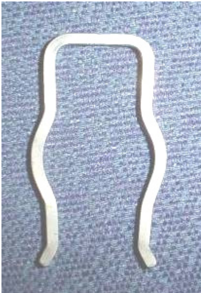
Photo 2 Retaining clip